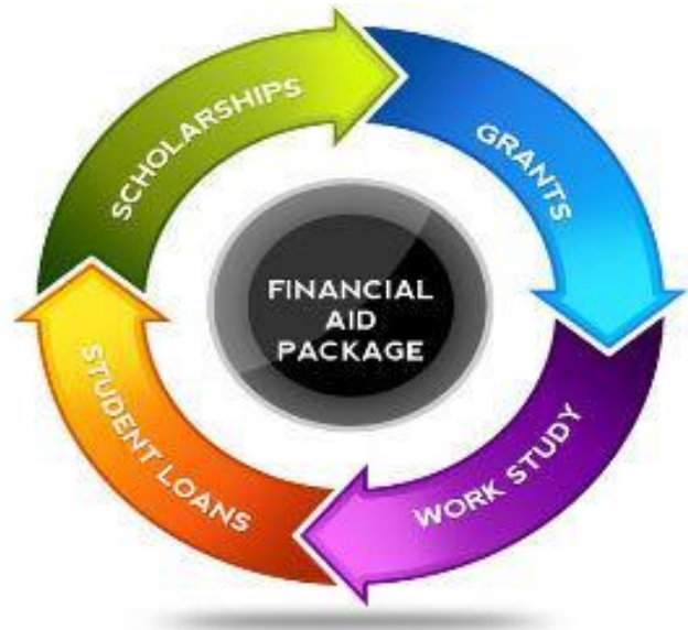
Types of Financial Aid