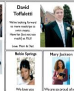
Eighth page ad