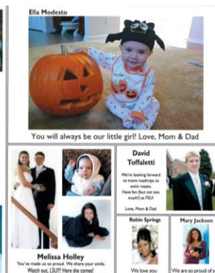
Half page ad