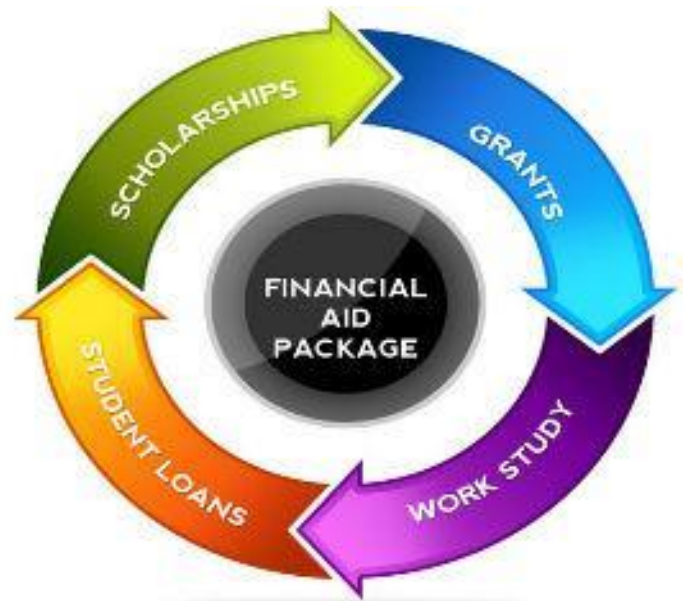
Types of Financial Aid